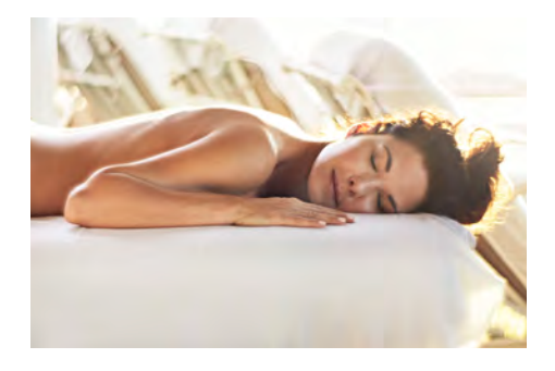
Sanctuary spa service Relax with Lotus Spa® service and Sanctuary menu items in the privacy of your Sky Suite